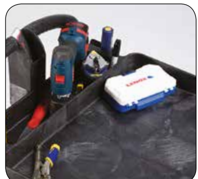
WORK MORE EFFICIENTLY Built-in tool holster and caddy keep items at hand and in place during transport.