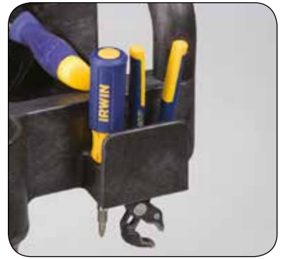
STAY ORGANISED Easy-reach tool/accessory hooks provide additional storage.